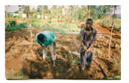
Working the fields