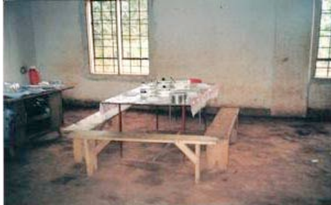
The dining room at Kininiative and testing the well at Kininiative donated by one of our kind benefactors